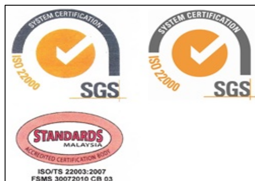
Figure 2. Logo specifications of FSMS logo

*please be noted that the type/ specifications of the logo is based on certification body applied*